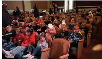
LES & RGS K-5 grade students got to attend a marionette performance at The Ritz Theater.