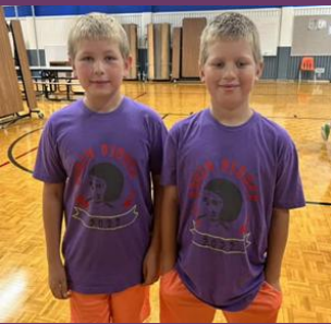
Twin Day at Lind Elementary School!