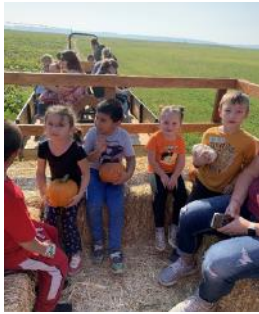
Lind Elementary TK, K & 1st grade classes went to Country Cousins Farm in Othello.