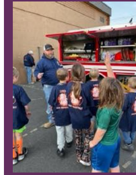
Thank you Lind Fire Department for putting on a great fire safety day at LES!