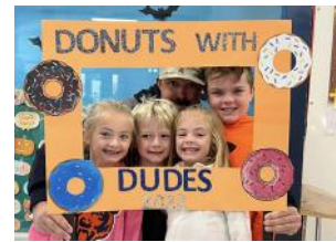
RGS had a great turnout for Donuts with Dudes!