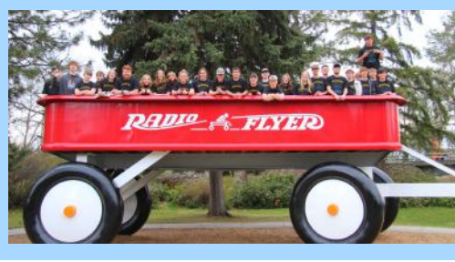
Lind-Ritzville FFA Poultry Evaluation team placed 6th in the state contest!