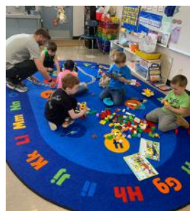
LES students learned about trains & force using a LEGO Education Stem kit.