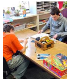
The LRMS after school Dungeons & Dragons group learned to draw their favorite characters.