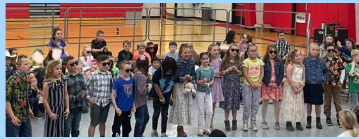
Ritzville Grade School Spring Concert