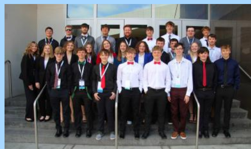
LRHS FBLA team attended the WA State FBLA Conference in Spokane.