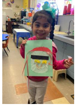
LES TK students learned about robots & created their own!