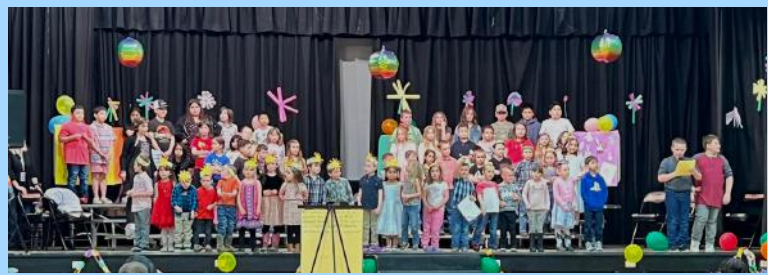
Lind Elementary School Spring Concert