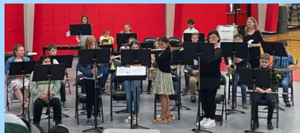
Ritzville Grade School 5th Grade Band