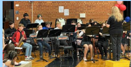
Lind Elementary School 5th Grade Band