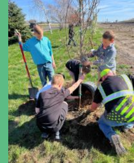
RGS 5th Grade planted trees for Arbor Day!